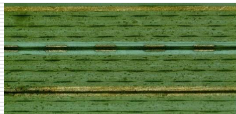
Image of Company A Hybrid coupler after hot air soldering at 400°C. Noticeably the device surface turns darkened and raised, delivering "damaged" RF test results.